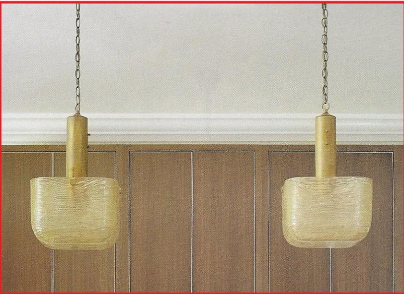
Oversize hammered bronze pulls, which required more than one trip to the foundry, accent custom rosewood cabinetry. The Calacatta marble bar features a slim bronze base, tapered legs and Bernhardt stools covered in Keleen leather. The pendants are vintage Murano glass from John Salibello.